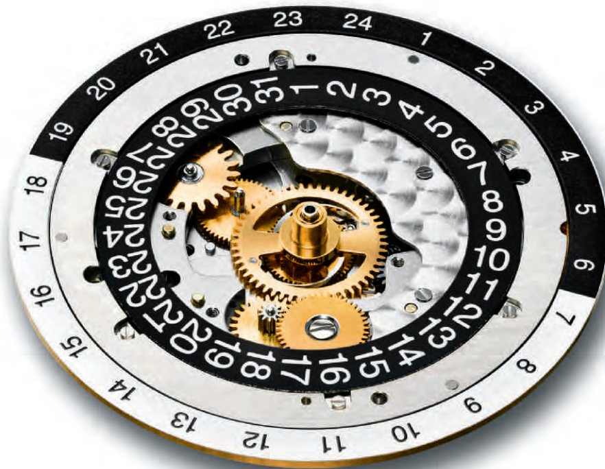
The 24-hour ring and date disc help the wearer keep track of different time zones