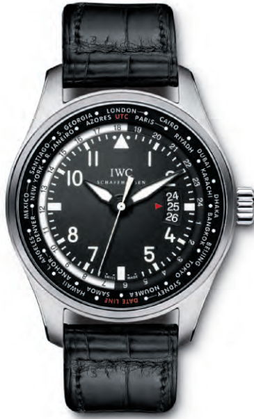
REF. IW326201 in stainless steel with black alligator leather strap

Mechanical movement · Self-winding · 42-hour power reserve when fully wound · Date display · Central hacking seconds · 24-hour display for Worldtimer function · Soft-iron inner case for protection against magnetic fields · Screw-in crown · Sapphire glass, convex, antireflective coating on both sides · Glass secured against displacement by drop in air pressure · Water-resistant 6 bar · Case height 13.5 mm · Diameter 45 mm