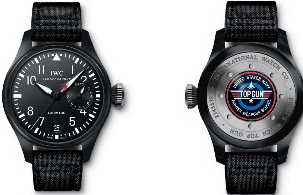
REF. IW501901 in ceramic with black soft strap

Mechanical movement · Pellaton automatic winding · IWC-manufactured 51111 calibre (50000-calibre family) · 7-day power reserve when fully wound · Power reserve display · Date display · Central hacking seconds · Glucydur® beryllium alloy balance with high-precision adjustment cam on balance arms · Breguet spring · Screw-in crown · Sapphire glass, convex, antireflective coating on both sides · Glass secured against displacement by drop in air pressure · Water-resistant 6 bar · Case height 15 mm · Diameter 48 mm