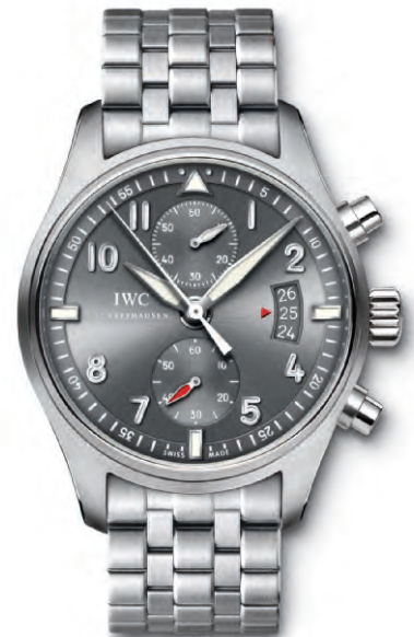
REF. IW387804 in stainless steel with stainless-steel bracelet

Mechanical chronograph movement · Self-winding · IWC-manufactured 89365 calibre (89000-calibre family) · 68-hour power reserve when fully wound · Date display · Stopwatch function with minutes and seconds · Flyback function · Small hacking seconds · Screw-in crown · Sapphire glass, convex, antireflective coating on both sides · Glass secured against displacement by drop in air pressure · Special back engraving · Water-resistant 6 bar · Case height 15.5 mm · Diameter 43 mm