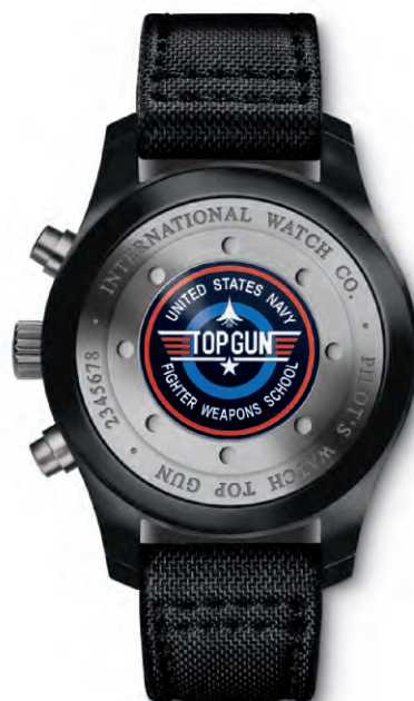
REF. IW388007 in ceramic with black soft strap

Mechanical chronograph movement · Self-winding · IWC-manufactured 89365 calibre (89000-calibre family) · 68-hour power reserve when fully wound · Date display · Stopwatch function with minutes and seconds · Flyback function · Small hacking seconds · Soft-iron inner case for protection against magnetic fields · Screw-in crown · Sapphire glass, convex, antireflective coating on both sides · Glass secured against displacement by drop in air pressure · Water-resistant 6 bar · Case height 16.5 mm · Diameter 46 mm