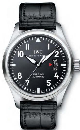
REF. IW326501 in stainless steel with black alligator leather strap