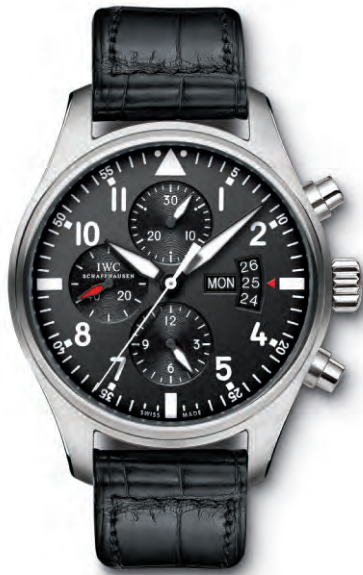
REF. IW377701 in stainless steel with black alligator leather strap