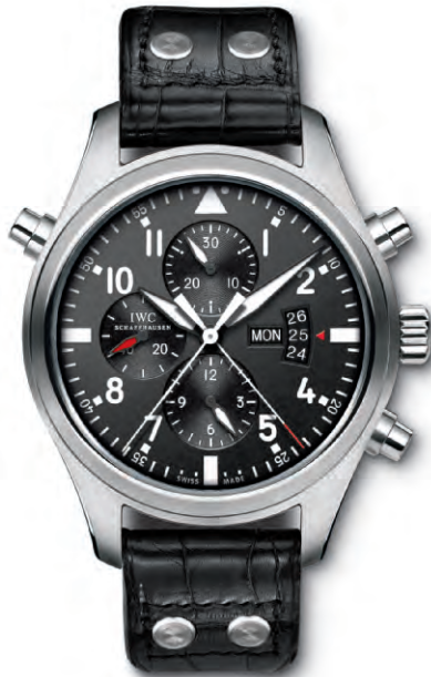
REF. IW377801 in stainless steel with black alligator leather strap

Mechanical chronograph movement · Self-winding · 44-hour power reserve when fully wound · Date and day display · Stopwatch function with hours, minutes and seconds · Small hacking seconds · Split-seconds hand for intermediate timing · Soft-iron inner case for protection against magnetic fields · Screw-in crown · Sapphire glass, convex, antireflective coating on both sides · Glass secured against displacement by drop in air pressure · Water-resistant 6 bar · Case height 17.5 mm · Diameter 46 mm