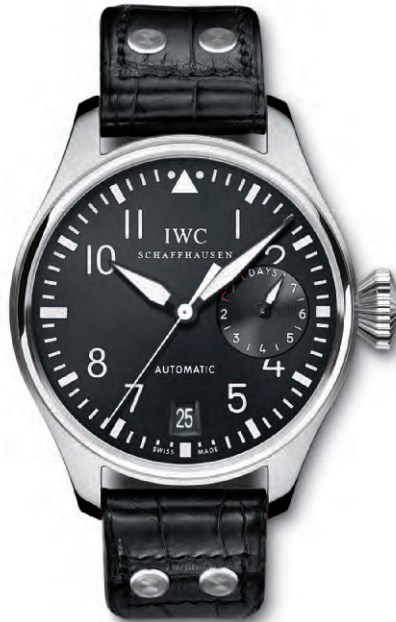
REF. IW500901 in stainless steel with black alligator leather strap

Mechanical movement · Pellaton automatic winding · IWC-manufactured 51111 calibre (50000-calibre family) · 7-day power reserve when fully wound · Power reserve display · Date display · Central hacking seconds · Glucydur® beryllium alloy balance with high-precision adjustment cam on balance arms · Breguet spring · Soft-iron inner case for protection against magnetic fields · Screw-in crown · Sapphire glass, convex, antireflective coating on both sides · Glass secured against displacement by drop in air pressure · Water-resistant 6 bar · Case height 16 mm · Diameter 46 mm