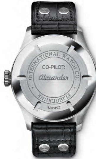
REF. IW325519 in stainless steel with black alligator leather strap

Mechanical movement · Self-winding · 42-hour power reserve when fully wound · Date display · Central hacking seconds · Screw-in crown · Sapphire glass, convex, antireflective coating on both sides · Glass secured against displacement by drop in air pressure · Water-resistant 6 bar · Case height 11 mm · Diameter 39 mm