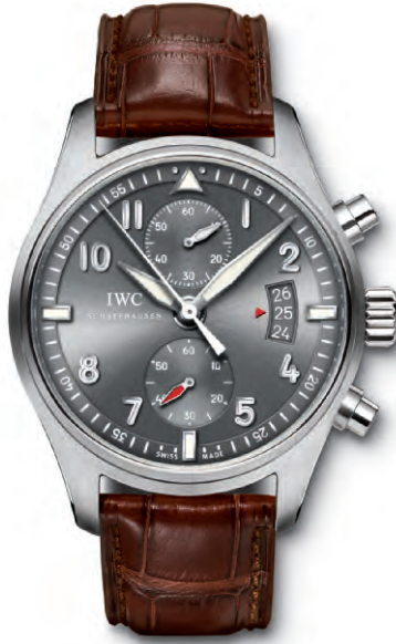
REF. IW387802 in stainless steel with brown alligator leather strap