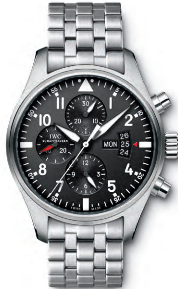
REF. IW377704 in stainless steel with stainless-steel bracelet

Mechanical chronograph movement · Self-winding · 44-hour power reserve when fully wound · Date and day display · Stopwatch function with hours, minutes and seconds · Small hacking seconds · Soft-iron inner case for protection against magnetic fields · Screw-in crown · Sapphire glass, convex, antireflective coating on both sides · Glass secured against displacement by drop in air pressure · Water-resistant 6 bar · Case height 15 mm · Diameter 43 mm