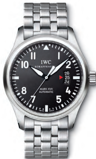
REF. IW326504 in stainless steel with stainless-steel bracelet

Mechanical movement · Self-winding · 42-hour power reserve when fully wound · Date display · Central hacking seconds · Soft-iron inner case for protection against magnetic fields · Screw-in crown · Sapphire glass, convex, antireflective coating on both sides · Glass secured against displacement by drop in air pressure · Water-resistant 6 bar · Case height 11 mm · Diameter 41 mm