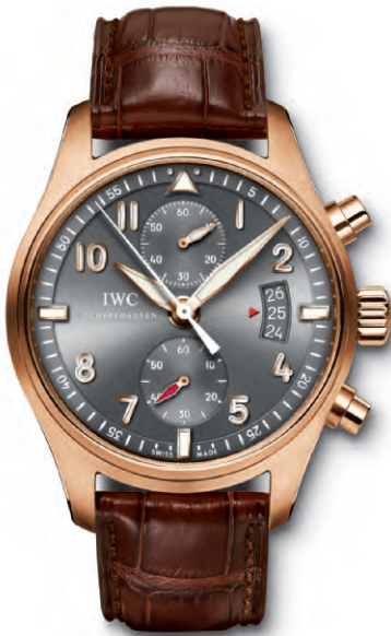
REF. IW387803 in 18-carat red gold with brown alligator leather strap