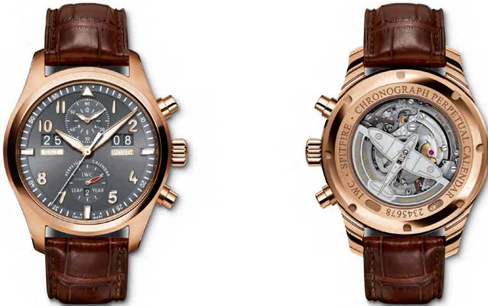
REF. IW379105 in 18-carat red gold with brown alligator leather strap

Mechanical chronograph movement · Self-winding · IWC-manufactured 89801 calibre (89000-calibre family) · 68-hour power reserve when fully wound · Perpetual calendar · Large double-digit displays for both the date and month · Leap year display · Stopwatch function with hours, minutes and seconds · Hour and minute counters combined in a totalizer at 12 o'clock · Flyback function · Small hacking seconds · Screw-in crown · Sapphire glass, convex, antireflective coating on both sides · Glass secured against displacement by drop in air pressure · See-through sapphire-glass back · Water-resistant 6 bar · Case height 17.5 mm · Diameter 46 mm